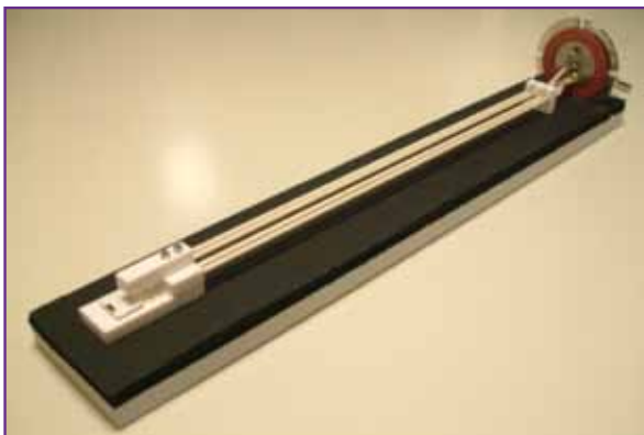
Fig 1. MIKES high temperature thermal conductivity measurements

Dr Ossi Hahtela and colleagues at MIKES in Finland are working on a new probe and setup for high temperature thermal conductivity measurements. The system is awaiting thorough testing with borofloat glass and silicon wafer samples, though preliminary results look good, at least at moderate temperatures. Once this final stage is completed and the results are in the group will start work on a research paper and conference presentation.